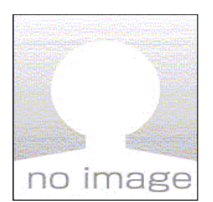
Gustavo Gomez, 43 Location Details Irvine, CA 92618