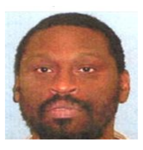
Charge/Offense Rape by force or fear.