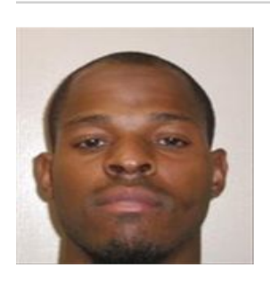
Offense Code CA18605326K2229