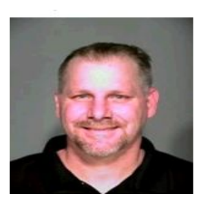
Charge/Offense Rape by force or fear.