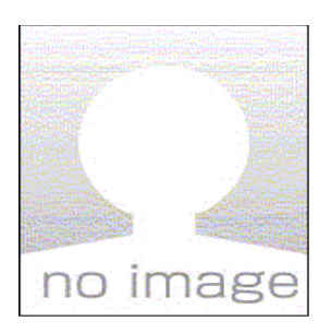
Anthony Arrellanocasas, 28 Location Details Highland, CA 92346