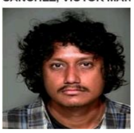
Charge/Offense Sexual battery.