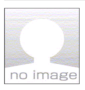
Offense Code CA52769594